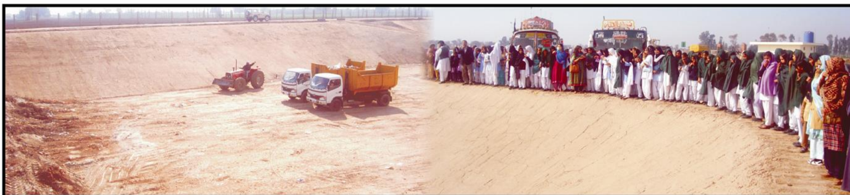
Planning Team and Students of TMA Chiniot Visited Landfill Site of SWM, TMA Chiniot

Finally all the participants of the program were taken to the landfill site to show them all the steps involved in final disposal of waste. A demonstration of the arm-rolled trucks carrying containers and disposing them on the land fill site was also shown to the participants. A soil cover was also spread over the compacted solid waste. The question-answer session was also held at the end of the tour. Participants showed keenness in understanding the entire process of solid waste collection and disposal.