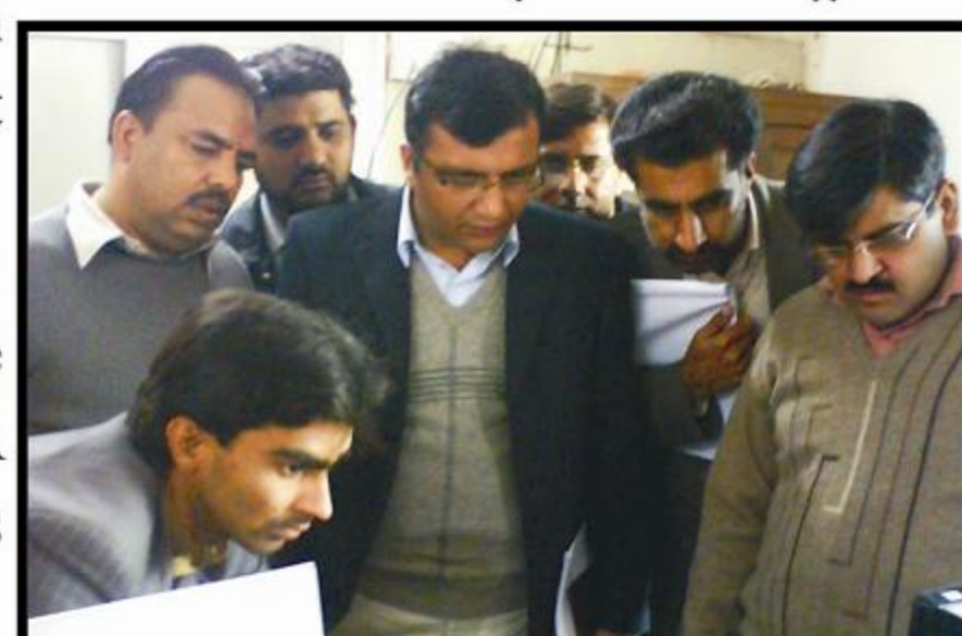
PMDFC Staff getting hands-on training