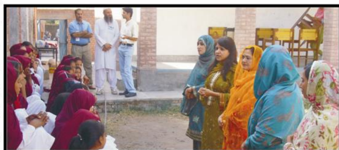
Planning Team Briefing about SWM to Students of TMA Chiniot