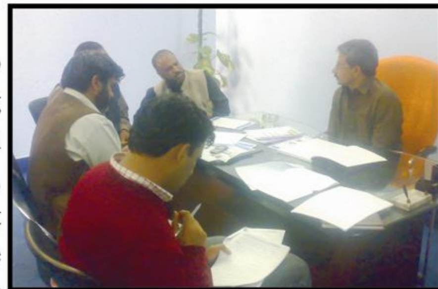
ID Team Visited TMA Patoki for Field Appraisal