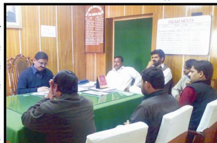
ID Team Visited TMA Bahawalpur Saddar for Field Appraisal