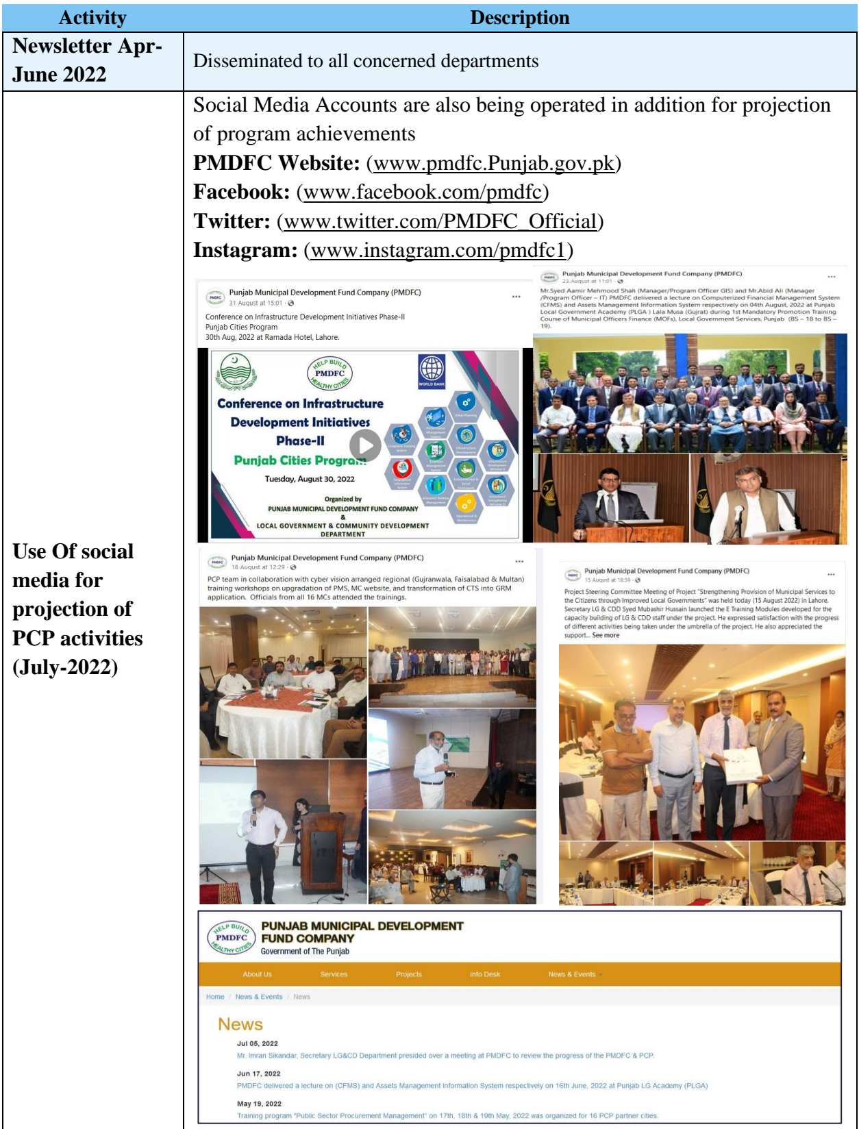
Table: 07 Communication Activities

Punjab Cities Program is the flagship program of Punjab Municipal Fund Development Company. To project the milestones achieved by PCP team, communication section is playing a major role. During the month of July 2022 following activities were completed successfully.