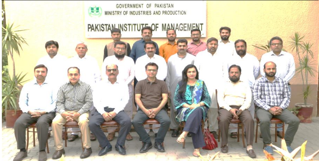
Group Photo of participants during the training session (Day-2) 18.05.2022