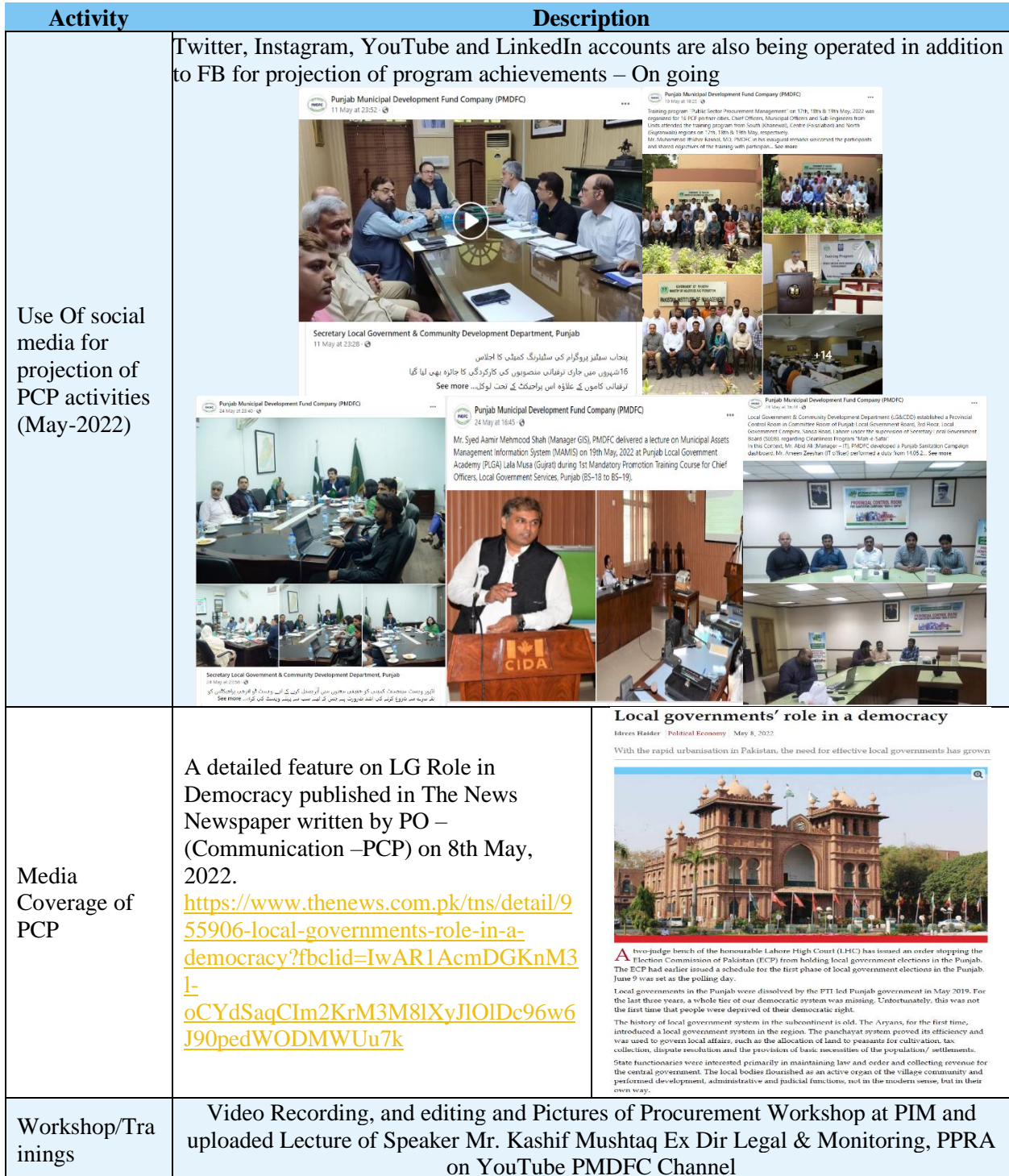
Table: 07 Communication Activities

Punjab Cities Program is the flagship program of Punjab Municipal Fund Development Company. To project the milestones achieved by PCP team communication section is playing a major role. During the last quarter many initiatives were taken few of them has been completed successfully which are Welding very good feedback while remaining few will also be completed shortly. Below are a few major communication activities which has been completed successfully.