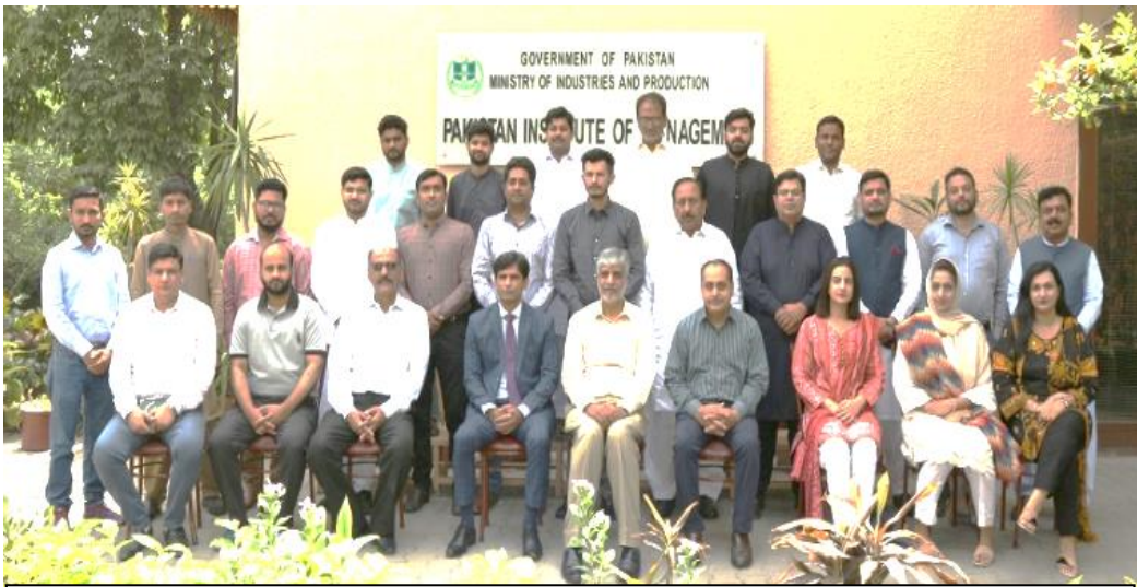
Group Photo of participants during the training session (Day-1) 17.05.2022