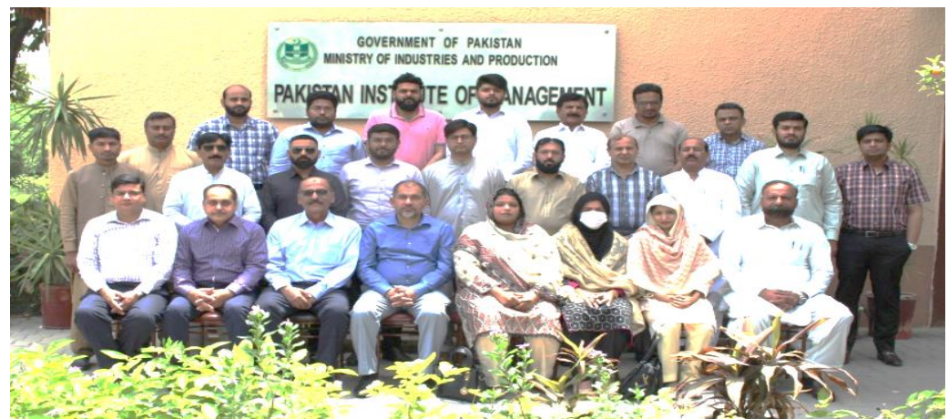
Group Photo of participants during the training session (Day-3) 19.05.2022