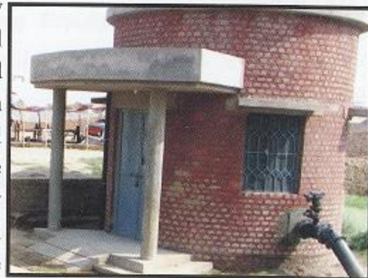
Water Works at TMA Kasur

Service delivery mechanism needs improvement in the water supply sector in almost all TMAs. This is mainly because of lack of technical know how at the support staff level. PMDFC has, therefore, developed operation & maintenance framework for municipal services for provision of sustainable and improved municipal services under institutional development initiative. Water supply system of Kasur and Jehlum have been selected as model projects for the implementation of water supply O&M Framework. Development of this assignment has been entrusted to Technical Consultant who is in close interaction with these TMAs. The following assignments are presently underway to improve the system; New log books, rapid assessment of the defects in existing infrastructure, site records, replacing the damaged equipments, preparing estimates for repairs and spares and dormant/abandoned over head reservoirs are being re-commissioned to improve the terminal pressure.