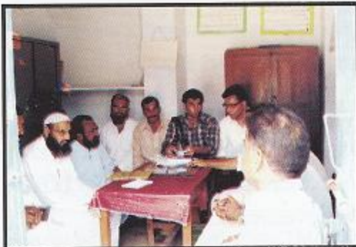
Discussion with School Teachers

All the ongoing sub projects are underway for compliance with Environmental Protection Agency, Punjab.