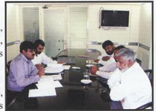
Meeting with TMA bahawalnagar officials

Individual meeting sessions for initiation of surveys of sewerage and parks, were held at PMDFC office for year-II TMAs in Sep 09. Sanitary inspectors and garden supervisors were invited to attend this session.