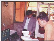
PMDFC and TMA Gojra Complaint cell Staff

PMDFC has introduced Performance Management System and Complaint Tracking System in Year II TMAs. In this regard, following officials are very regular in updating and reporting PMS & CTS data: