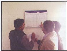
PMDFC and TMA Renala Khurd Complaint Cell Staff