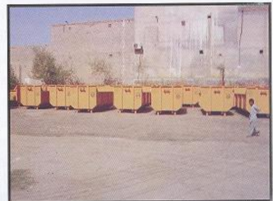
SWM Containers delivered at Mailsi