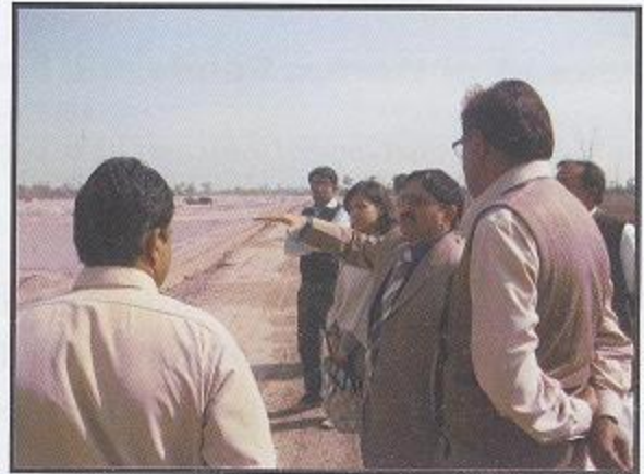
PMDFC and TMA Chiniot at Landfill Site