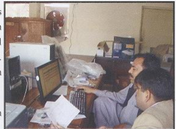
PMDFC Staff With TMA Burewala Staff

Advance Computer Training (AutoCAD) started in 3 Year-II TMAs (Mandi Bahauddin, Malakwal & Vehari). This advance training has been developed to focus I&S & P&C sections of the TMA to realize the full benefits of this capacity building intervention to be initiated by PMDFC. Twenty One trainees from above said three TMAs are participating in this training programme.