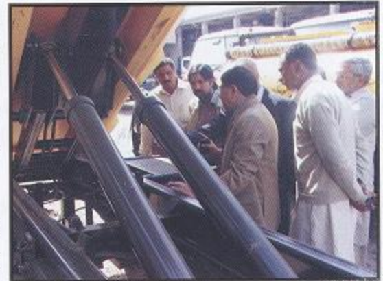
Inspection of SWM Goods Mailsi