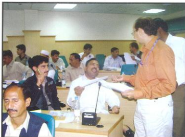
Group Exercise of Participants how to fill CTS Register