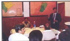
Director (EIA) EPA, Punjab (centre), Manager (PMDFC) (right) during Public hearing in CO unit Mustafabad - TMA Kasur.