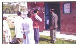
PMDFC & TMA staff during site visit in Liaquatpur