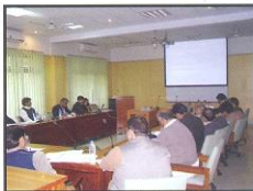
Participants of the Workshops