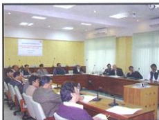
Participants of the Workshops