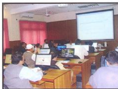
Participants of the FMSWorkshops