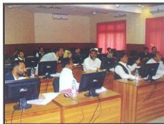
Participants of the FMSWorkshops