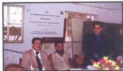
Director (EIA) EPA, Punjab (centre), Deputy Director (EIA) (left), Manager (PMDFC) (right) during Public hearing in CO unit Khudian-TMA Kasur.

Public Hearings by EPA, Punjab, have been scheduled for six sub-Projects in various TMAs shortly.