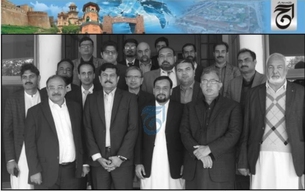
مردان، پنجاب میونسپل ڈویلپمنٹ فنڈ کمپنی اور لوکل گورنمنٹ کے افسران کا ڈبلیو ایس ایس سی ایم کے دورے کے موقع پر گروپ فوٹو